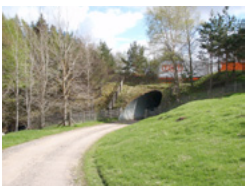
Fig. 7: Access track emerging from underpass

(c) The underpass north to Ballinluig Farm: It is proposed to construct a new section of drive from the area in which the access track emerges from the underpass tunnel. The new access would cross the existing drive<sup>5</sup> and continue around the northern edge of the grass field, tucked in close to an existing bank of oakwood. In conjunction with the establishment of the new section of drive, the landscaping details include proposals for new woodland blocks. Two ponds are also proposed along this section. The first pond would be created close to the start of the new section of drive, near the underpass tunnel, while the second pond would be developed at the western end of the new section of drive, close to the existing track from Ballinluig Farm. Both ponds would be fed by existing burns. It is also proposed to remove existing fences on the farm road from the underpass to Ballinluig Farm, in order that "traffic on the lodge road has an uninterrupted view across pasture land."