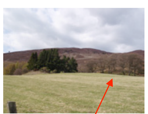
Fig. 9: proposed new access drive close Fig. 10: Access drive would follow to wooded area