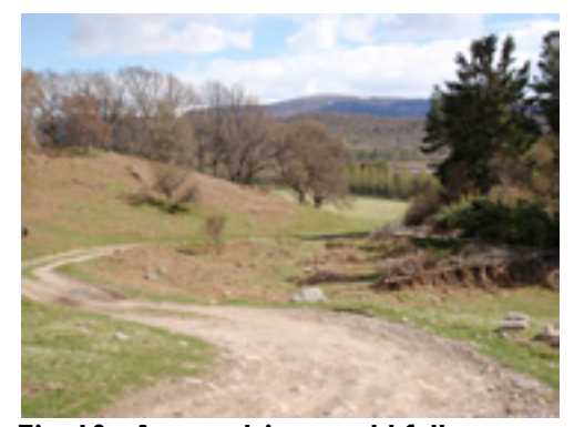
general route of existing track

(d) Ballinluig Farm to the proposed new sporting lodge: close to Ballinluig Farm, the new access drive would turn northwards, in a gap in the woodland, along the line of an existing section of rough track. On the final approaches to the main site area, the first significant views of the proposed lodge would emerge. Existing groups of birch in the vicinity would be retained. The final approach towards the lodge would result in the new access drive winding its way in a westerly and then northerly direction, following a natural basin in the landform. It is proposed to