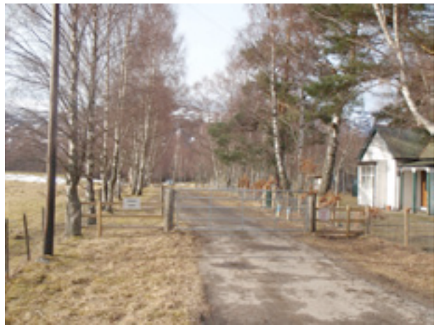
Fig. 5: Access drive off the B9152, adjacent to Ballinluig Cottage