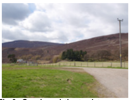
Fig. 8: Crossing existing track to Ballinluig Farm