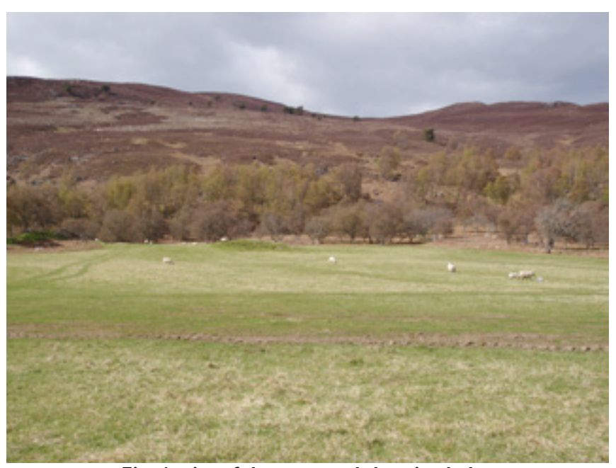
Fig. 4: site of the proposed shooting lodge

4. Although the southern elevation is essentially the front of the property and would be the elevation visible on the approach along the access drive, the main entrance is proposed in the rear (northern elevation), and would be accessed directly from a large courtyard area. Entrance features in the front (southern) elevation are curtailed to two sets of centrally positioned French doors, which would provide direct access from the formal and informal dining rooms to an outdoor flagstoned area.