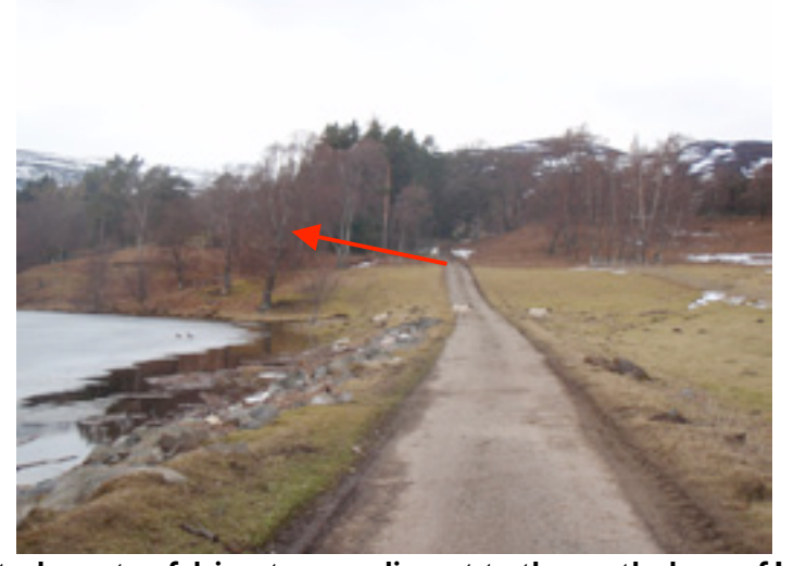
Fig. 6: Westerly route of drive, to run adjacent to the north shore of Loch Alvie